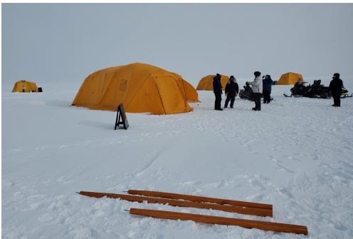
A field research camp in Utqiagvik, Alaska.